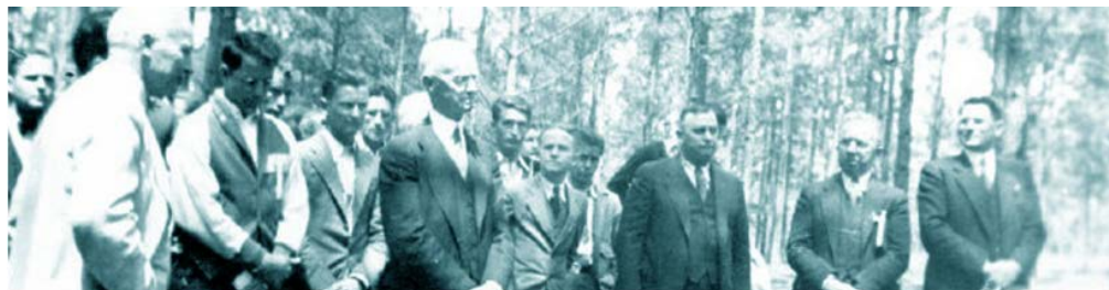
Charles Holmes Herty