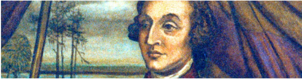
James Edward Oglethorpe