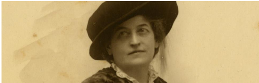
Juliette Gordon Low